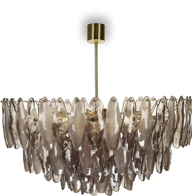
SPECTRE ROUND CHANDELIER CL850-RO-100 BRONZE & BRONZE SATIN & BRUSHED GOLD H: 53 cm (20.87") x D: 100 cm (39.37")