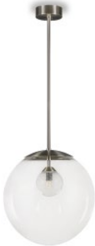
ORBIS PENDANT CL854 CLEAR & BRUSHED NICKEL H: 40 cm (15.74") x D: 40 cm (15.74")

The Orbis Pendant light blend timeless sophistication with modern artistry. Inspired by celestial orbits, each piece features a beautifully crafted glass sphere with an inner globe design, creating a sense of weightless elegance. Available in Olive, Cacao, and Clear, these luminous pendants appear to float effortlessly, bringing a refined yet contemporary touch to any space.