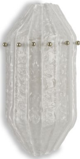
ZOE WALL LIGHT WL853 CLEAR SATIN & BRUSHED GOLD H: 41 cm (16.15") x W: 21 cm (8.27") x D: 10.5 cm (4.13")