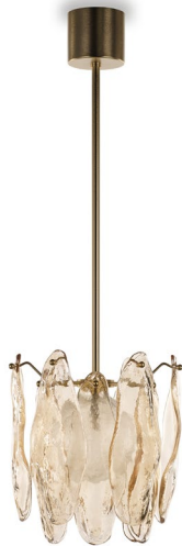
SPECTRE PENDANT CL850-PEN CHAMPAGNE & BRUSHED GOLD H: 29.5 cm (11.61") x D: 25 cm (9.84")