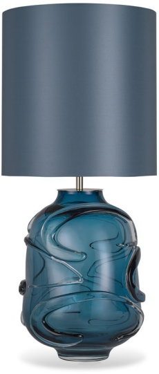
WALTZ TABLE LAMP TL861 AZURE & BRUSHED NICKEL WITH 12" TALL DRUM SHADE H: 44.5 cm (17.52") x D: 24 cm (9.45")