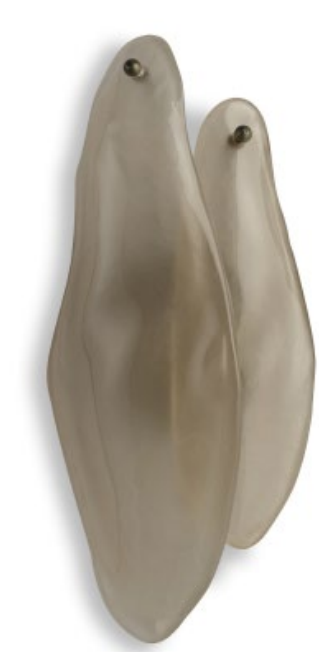
SPECTRE WALL LIGHT WL850 CHAMPAGNE SATIN & BRUSHED BRONZE H: 40 cm (15.74") x W: 18cm (7.09") x D: 10.5 cm (3.93")