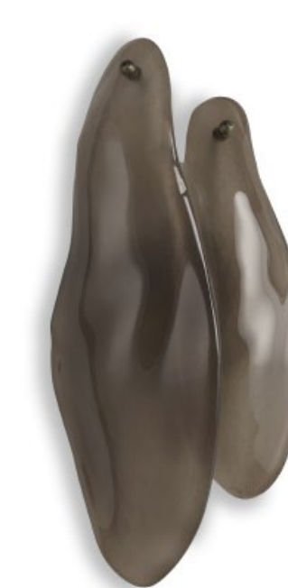
SPECTRE WALL LIGHT WL850 BRONZE SATIN & BRUSHED BRONZE H: 40 cm (15.74") x W: 18cm (7.09") x D: 10.5 cm (3.93")