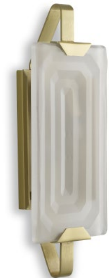
ETERNITY WALL LIGHT WL856 CLEAR & BRUSHED GOLD H: 34.4 cm (13.54") x W: 160 cm (62.99") x D: 60 cm (23.62")

The Eternity Wall Light combines refined elegance with contemporary artistry. Crafted from a single piece of moulded frosted glass, it masterfully emulates the appearance of layered plates, creating a subtle interplay of texture and depth. Finished with expertly crafted brass accents, its minimalist yet striking design integrates effortlessly into both modern and classic interiors. The Eternity Wall Light offers soft illumination that enhances the atmosphere with a beautifully balanced glow.