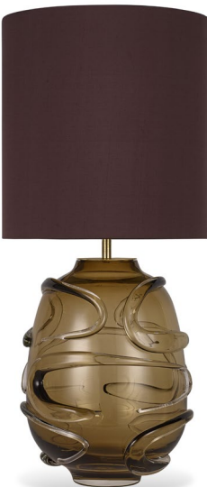
WALTZ TABLE LAMP TL861 COCAO & BRUSHED GOLD WITH 12" TALL DRUM SHADE H: 44.5 cm (17.52") x D: 24 cm (9.45")