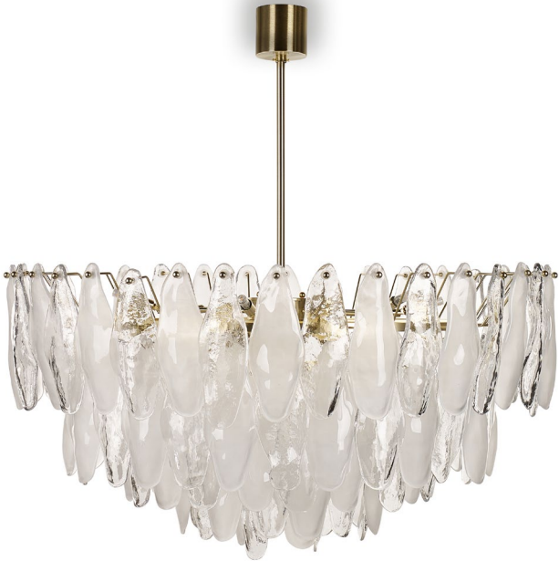
SPECTRE ROUND CHANDELIER CL850-RO-100 CLEAR & CLEAR SATIN & BRUSHED GOLD H: 53 cm (20.87") x D: 100 cm (39.37")