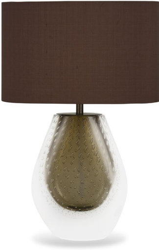
MONSOON TABLE LAMP TL860 CACAO & BRUSHED BRONZE WITH 12" OVAL SHADE H: 35 cm (13.78") x W: 19 cm (7.48") x D: 8.5 cm (3.35")

The Monsoon Table Lamp offers you the opportunity to harness the power of nature's soothing energy. The crashing rains of this spectacle of the natural world are completely immobilised within an elegant teardrop shaped glass form. Created in an array of elemental colourways, watch as bubbles dance in a rhythmic pattern evoking the sway of raindrops as they fall and bring the hypnotic energy of a refreshing monsoon into your home.