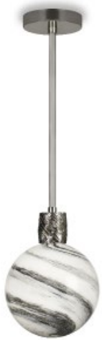
STORM PENDANT CL855 ANDESITE & BRUSHED NICKEL H: 24cm (9.44") x D: 18 cm (7.08")