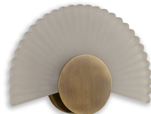
STARBURST WALL LIGHT WL855 SATIN & BRUSHED BRONZE H: 26 cm (10.24") x W: 38 cm (14.96") x D: 6.5 cm (2.56")