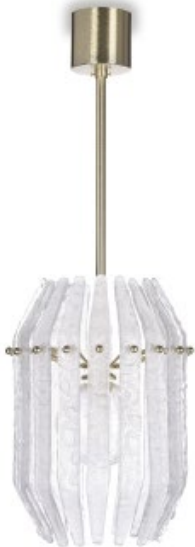
ZOE PENDANT CL853-PEN CLEAR SATIN & BRUSHED GOLD H: 41 cm (16.15") x D: 21 cm (8.27")

The Zoe Pendant embodies contemporary elegance with its textured, hand-finished glass, designed to enhance the brilliance of faceted glass globes that softly diffuse light. Paired with sleek metalwork, it offers a refined aesthetic for various interiors. Echoing this sophistication, the Zoe Wall Light features the same exquisite glass in a sculptural form, casting a warm, ambient glow. Inspired by modern architecture, its geometric design complements both classic and contemporary spaces. Whether as a statement piece or paired with matching fixtures, the Zoe Wall Light adds understated luxury to any setting.