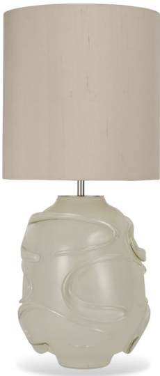
WALTZ TABLE LAMP TL861 PHANTOM & BRUSHED NICKEL WITH 12" TALL DRUM SHADE H: 44.5 cm (17.52") x D: 24 cm (9.45")

The Waltz Table Lamp is adorned with rhythmic swirling glass trails that evoke the graceful movements of the ballroom dance from which it gains its name. This bold creation not only brightens your room but also serves as a captivating centrepiece, its refined posture stands tall and proud while its whirling decoration embodies the beauty and fluidity of a duet dancing the Waltz.