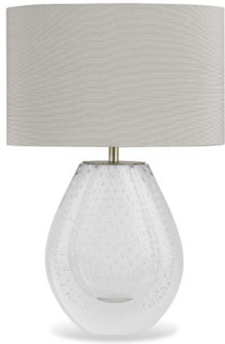
MONSOON TABLE LAMP TL860 CLEAR & BRUSHED GOLD WITH 12" OVAL SHADE H: 35 cm (13.78") x W: 19 cm (7.48") x D: 8.5 cm (3.35")