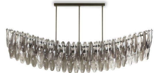
SPECTRE CURVED OVAL CHANDELIER CL850-CO BRONZE & BRONZE SATIN & BRUSHED BRONZE H: 60 cm (23.62") x W: 200 cm (78.74) x D: 40.5 cm (15.94")