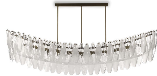
SPECTRE CURVED OVAL CHANDELIER CL850-CO CLEAR & CLEAR SATIN & BRUSHED BRONZE H: 60 cm (23.62") x W: 200 cm (78.74) x D: 40.5 cm (15.94")

A captivating balance of fluidity and form, the Spectre Oval Curved Chandelier is an exquisite expression of movement and light. Inspired by organic silhouettes, its cascading glass elements are individually hand-finished. With a gentle interplay of transparency and opacity, the chandelier diffuses light in a warm, ethereal glow, creating an intimate yet striking ambience. Its sculptural elegance makes it a centrepiece in both contemporary and classic interiors, adding depth, dimension, and a quiet sense of drama. Available in Clear, Champagne and Bronze finishes, the Spectre Curved Oval Chandelier embodies the artistry of handcrafted design, transforming spaces with effortless sophistication.