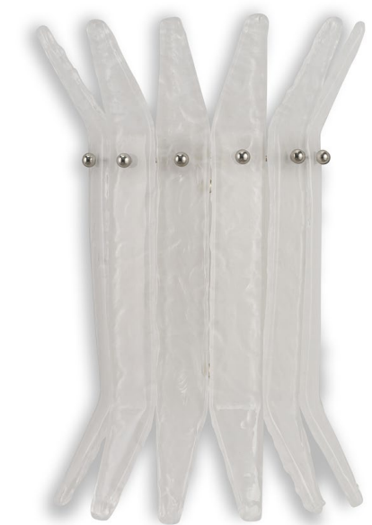
STROBE WALL LIGHT WL851 CLEAR SATIN & BRUSHED NICKEL H: 41 cm (16.14") x D: 10.5 cm (4.13")