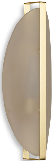
MONARCH WALL LIGHT WL852 SATIN & BRUSHED GOLD H: 32 cm (12.6") x W: 13 cm (5.129") x D: 8 cm (3.15")