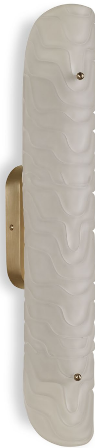
CASCADE WALL LIGHT WL854

The Cascade Wall Light is a sculptural statement of movement and texture. Its softly undulating glass surface, reminiscent of rippling water, captures and diffuses light with a warm, ambient glow. Crafted with meticulous attention to detail, its organic form adds depth and dimension to any interior. Designed for impact, the Cascade's generous size makes it ideal for larger spaces, from grand hallways to luxurious living areas. Whether installed as a standalone feature or in multiples for a dramatic effect, this striking wall light enhances interiors with a sense of fluidity and refined elegance.