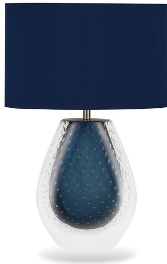
MONSOON TABLE LAMP TL860 AZURE & BRUSHED NICKEL WITH 12" OVAL SHADE H: 35 cm (13.78") x W: 19 cm (7.48") x D: 8.5 cm (3.35")