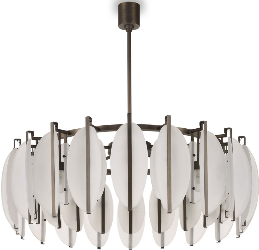
MONARCH CHANDELIER CL852-100 SATIN & BRUSHED BRONZE H: 35 cm (13.78") x D: 100 cm (39.37")

The Monarch Chandelier draws inspiration from the delicate beauty of the Monarch butterfly, offering a majestic lighting fixture with a graceful, organic design. Featuring a crown of glass petals that fan outward, this chandelier mimics the soft fluttering of butterfly wings, adding a touch of elegance to any room. Ideal for interiors with lower ceilings, the Monarch Chandelier can be customised to drop less than 50cm. With a ring of internal glass diffusers, it ensures a balanced glow from every angle while maintaining a light, airy presence. Perfect for those seeking both beauty and functionality in a statement light.