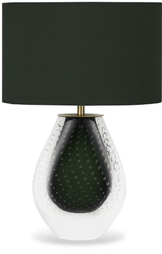
MONSOON TABLE LAMP TL860 FOREST GREEN & BRUSHED GOLD WITH 12" OVAL SHADE H: 35 cm (13.78") x W: 19 cm (7.48") x D: 8.5 cm (3.35")