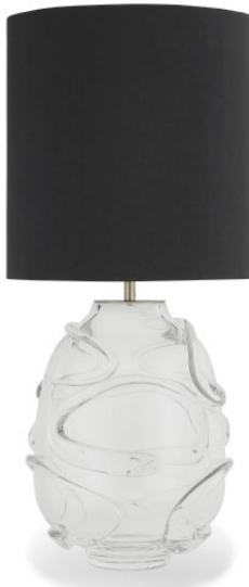
WALTZ TABLE LAMP TL861 CLEAR & BRUSHED GOLD WITH 12" TALL DRUM SHADE H: 44.5 cm (17.52") x D: 24 cm (9.45")