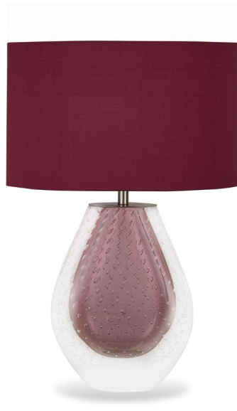
MONSOON TABLE LAMP TL860 ROSE & BRUSHED NICKEL WITH 12" OVAL SHADE H: 35 cm (13.78") x W: 19 cm (7.48") x D: 8.5 cm (3.35")