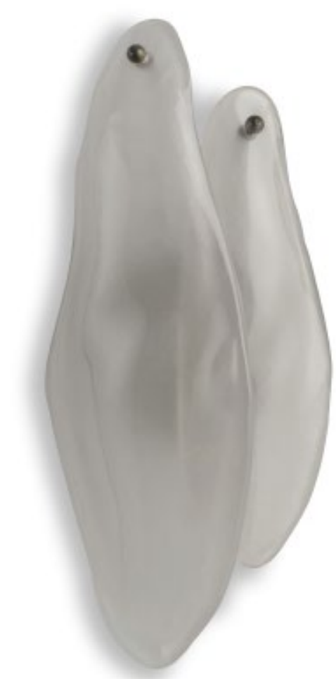
SPECTRE WALL LIGHT WL850 CLEAR SATIN & BRUSHED BRONZE H: 40 cm (15.74") x W: 18cm (7.09") x D: 10.5 cm (3.93")

A vision of fluidity and light, the Spectre Wall Light evokes the ethereal beauty of flowing fabric, frozen in time through hand-sculpted glass. Its organic form diffuses a soft, ambient glow, casting delicate shadows that shift with the changing light. Hand-sculpted from delicate glass, each piece appears to shift and flow, diffusing illumination in a way that feels both organic and weightless. Designed to bring depth and artistry to interiors, Spectre transforms walls into luminous sculptures, striking the perfect balance between subtle elegance and bold statement.