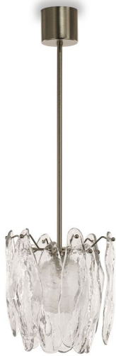
SPECTRE PENDANT CL850-PEN CLEAR & BRUSHED NICKEL H: 29.5 cm (11.61") x D: 25 cm (9.84")

The Spectre Pendant captures the essence of movement and light in a sculptural form. Its delicately handcrafted glass panels, reminiscent of cascading fabric, create an interplay of texture and transparency, diffusing a soft, ambient glow. Designed to complement both intimate and expansive spaces, this pendant had an inner glass globe feature bringing a refined yet organic presence, whether positioned alone as a focal point or in a series for a dramatic effect. The fluidity of its silhouette, paired with the gentle illumination, offers a sense of weightlessness, an elegant balance between artistry and function.