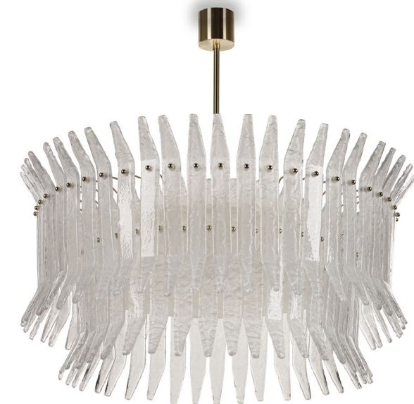
STROBE CHANDELIER CL851-100 CLEAR SATIN & BRUSHED GOLD H: 53 cm (20.87") x D: 100 cm (39.37")

Striking and sculptural, the Strobe Chandelier is a bold statement in contemporary lighting. Its precisely arranged textured glass blades radiate outward, refracting light in a dynamic interplay of shadow and brilliance. Inspired by movement and rhythm, Strobe captures the essence of modern elegance with its sharp yet fluid design. Suspended from a sleek metal frame, this chandelier transforms any space with its sophisticated presence, whether glowing warmly in the evening or standing as a striking focal point by day. Perfect for interiors that embrace both drama and refinement, the Strobe Chandelier is an illuminated work of art.