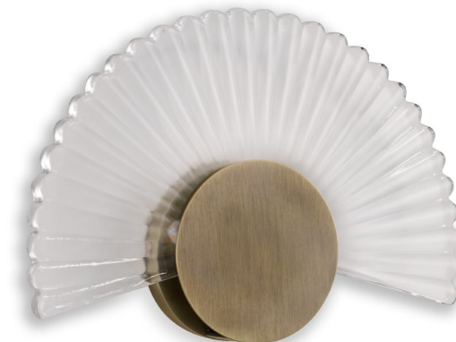
STARBURST WALL LIGHT WL855 CLEAR & BRUSHED BRONZE H: 26 cm (10.24") x W: 38 cm (14.96") x D: 6.5 cm (2.56")

An attractive combination of vintage appeal and modern design, the Starburst Wall Light features an embossed linear pattern which explodes from a central point. In parred back contemporary styling, the radiating lines are pressed into a scalloped fan silhouette, drawing clear inspiration from the Art Deco era. The Starburst Wall Light is an example of truly timeless style and offers a warm ambiance for your home.