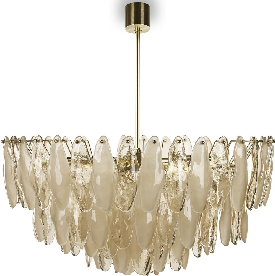
SPECTRE ROUND CHANDELIER CL850-RO-100 CHAMPAGNE & CHAMPAGNE SATIN & BRUSHED GOLD H: 53 cm (20.87") x D: 100 cm (39.37")

A luminous expression of movement and artistry, the Spectre Round Chandelier embodies the soul of the Anima Collection fluid and organic. Inspired by the delicate interplay of light and texture, its sculptural form is composed of individually hand-finished glass elements, evoking the graceful motion of cascading fabric or the quiet elegance of a flickering flame. Designed to captivate, the chandeliers soft, diffused illumination creates an intimate ambience, enveloping the space with a warm, glow. The interplay of transparency and opacity lends depth and dimension, making it a striking centrepiece that transforms both contemporary and classic interiors. Crafted with meticulous attention to detail, the Spectre Round Chandelier is available in Clear, Champagne and Bronze, offering versatility while maintaining its signature poetic aesthetic.