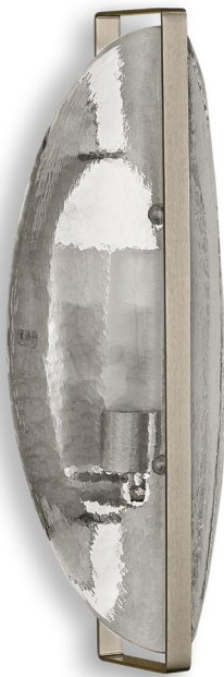
MONARCH WALL LIGHT WL852 CLEAR & BRUSHED NICKEL H: 32 cm (12.6") x W: 13 cm (5.129") x D: 8 cm (3.15")