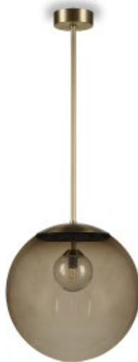
ORBIS PENDANT CL854 CACAO & BRUSHED BRONZE H: 40 cm (15.74") x D: 40 cm (15.74")