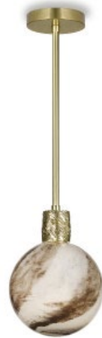
STORM PENDANT CL855 MAPLE & BRUSHED GOLD H: 24cm (9.44") x D: 18 cm (7.08")

Our Storm Pendant captures the natural beauty of swirling patterns and organic textures, inspired by the dynamic movement of white-water rapids and powerful storms. Each glass globe is individually hand-blown, creating a unique marbled effect that mirrors the energy and motion of a storm. Suspended from a finely detailed metal collar with swirling textures, the Storm Pendant blends bold design with timeless elegance.