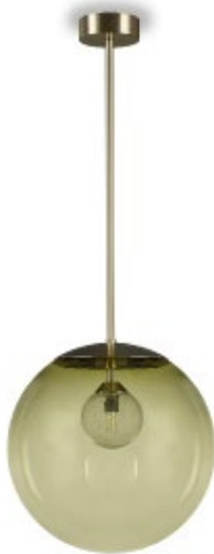
ORBIS PENDANT CL854 OLIVE & BRUSHED GOLD H: 40 cm (15.74") x D: 40 cm (15.74")