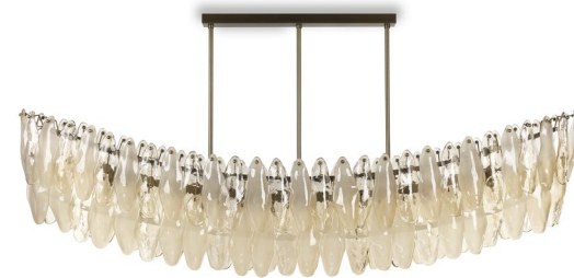
SPECTRE CURVED OVAL CHANDELIER CL850-CO CHAMPAGNE & CHAMPAGNE SATIN & BRUSHED BRONZE H: 60 cm (23.62") x W: 200 cm (78.74) x D: 40.5 cm (15.94")