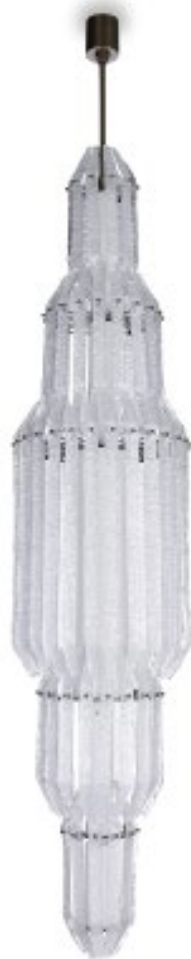
ZOE CHANDELIER CL853 CLEAR SATIN & BRUSHED BRONZE H: 205 cm (80.70") x W: 42.5 (16.73) x D: 42.5 cm (16.73")

The Zoe Chandelier is a captivating centrepiece, showcasing refined craftsmanship and architectural elegance. Inspired by the rhythmic motion of a Zoetrope and the geometric glamour of Art Deco design, its sleek profile and meticulously arranged textured glass prisms create a cascading form that reflects and refracts light with a subtle brilliance. Specifically designed for stairwells, the Zoe's impressive overall height and streamlined silhouette make it the perfect statement piece for spaces that demand both drama and sophistication. Balancing timeless appeal with modern versatility, this chandelier enhances both contemporary and classic interiors with effortless grace.