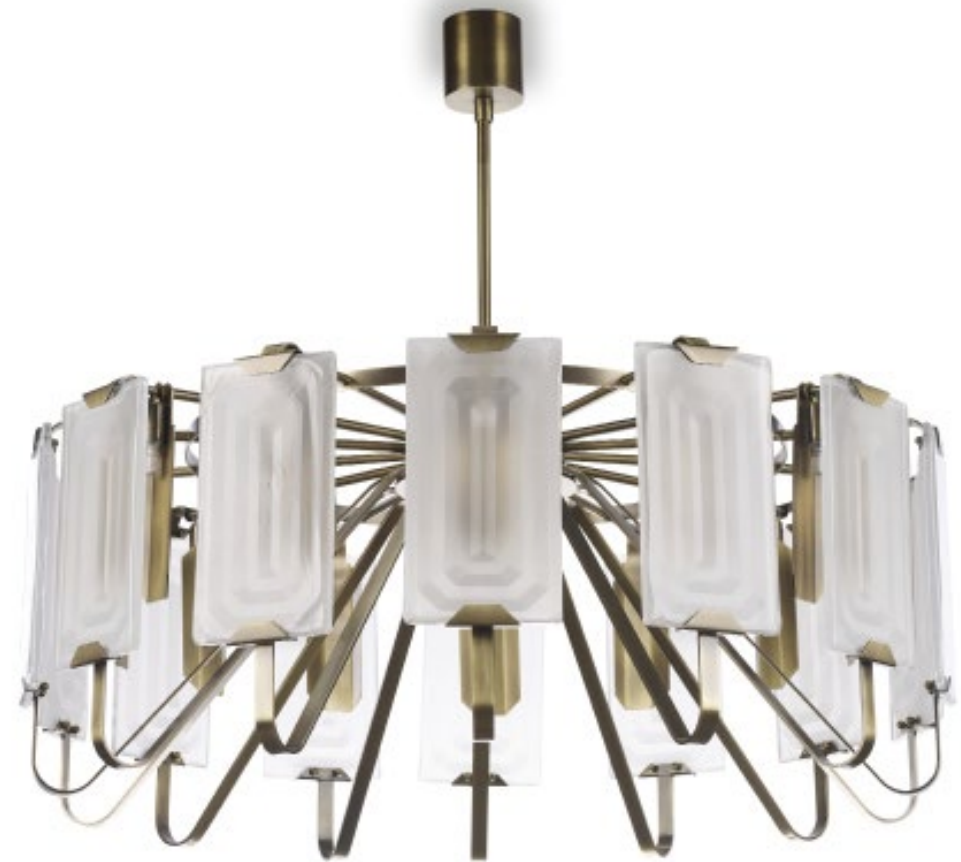
ETERNITY CHANDELIER CL856-100 CLEAR SATIN & BRUSHED BRONZE H: 40 cm (15.78") x W: 100 cm (39.37") x D: 100 cm (39.37")

The Eternity Chandelier is a masterpiece of modern lighting. This exquisite design features one sided frosted glass panels. Inspired by the mesmerising effect of infinity mirrors, arranged in layered geometric formations. This interplay of texture and light captivates attention from every angle. Our beautiful metalwork lends timeless elegance, perfectly complementing the chandelier's bold yet refined presence. Thoughtfully blending sculptural artistry with a radiant glow, the Eternity Chandelier is a true statement piece. It embodies the collection's essence with its harmonious balance of boldness and serenity, bringing an air of sophistication to any space.