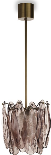
SPECTRE PENDANT CL850-PEN BRONZE & BRUSHED BRONZE H: 29.5 cm (11.61") x D: 25 cm (9.84")